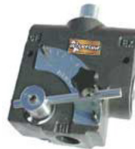
W, WR & FC MODELS