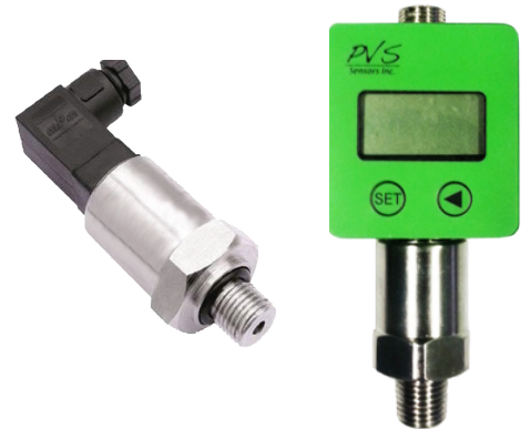
TDD MODEL WITH LCD DISPLAY